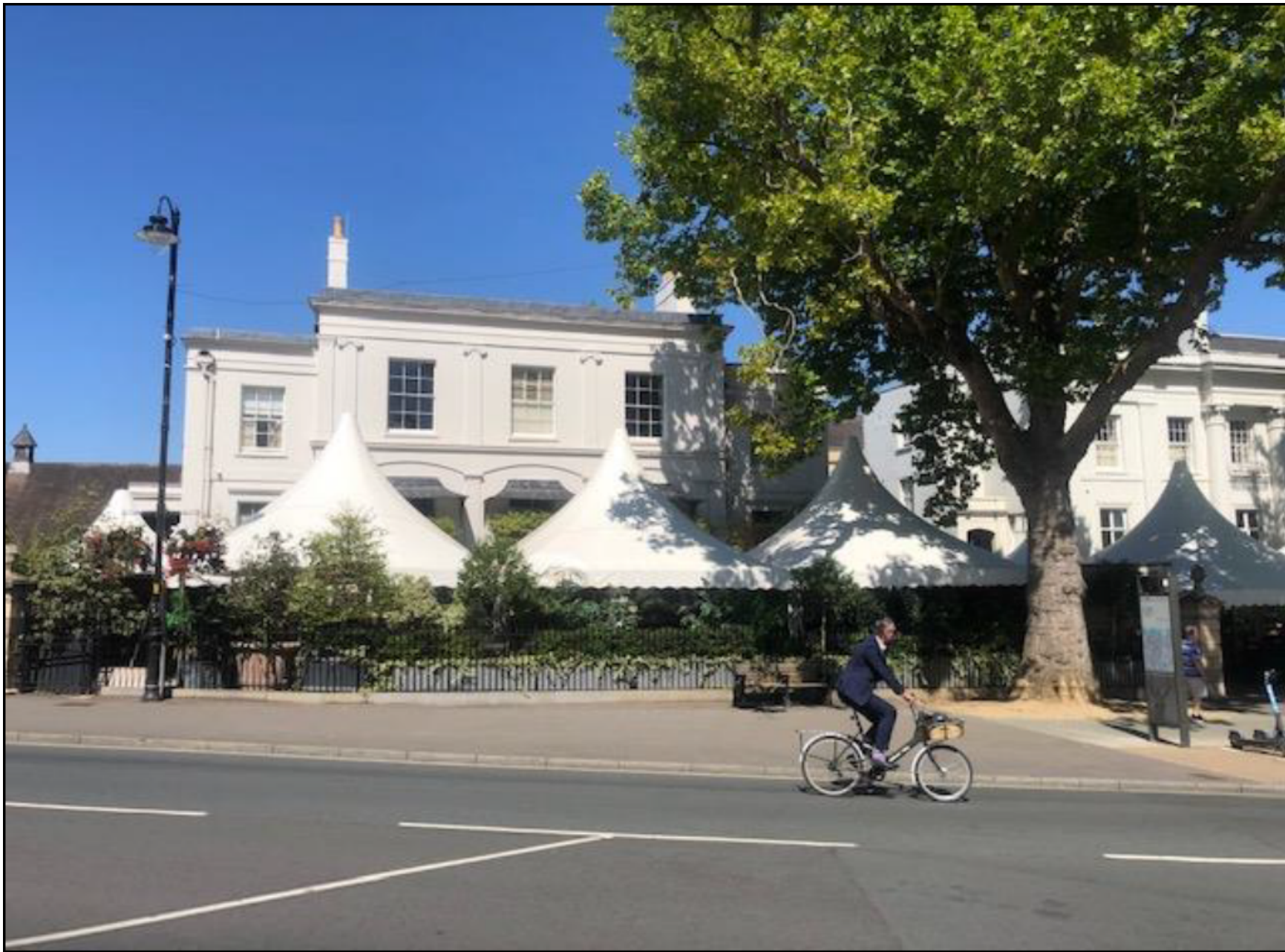
Photograph of the marquees in front of 133 The Promenade