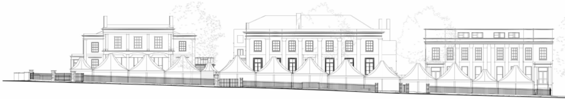
Front Elevation - As Existing (NOTE: Elevation shows current marquee layout as existing at time of current application)