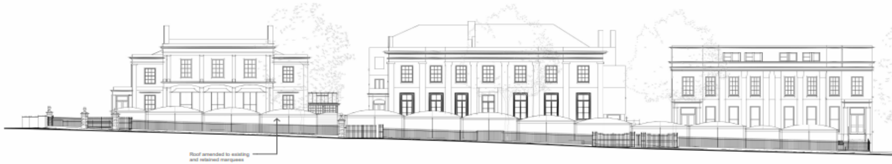
Front Elevation - Proposed