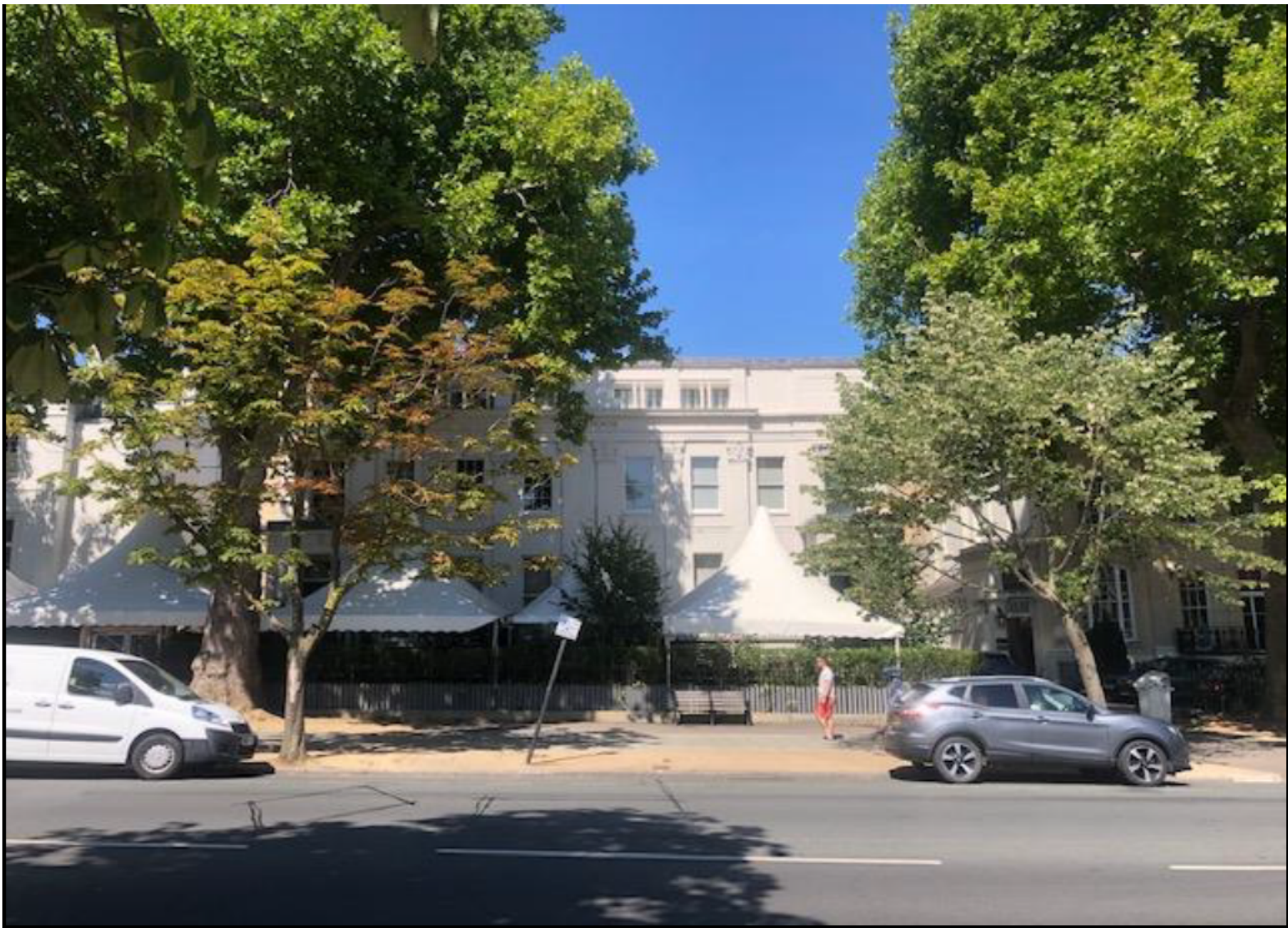
Photograph of the marquees in front of 125 - 127 The Promenade