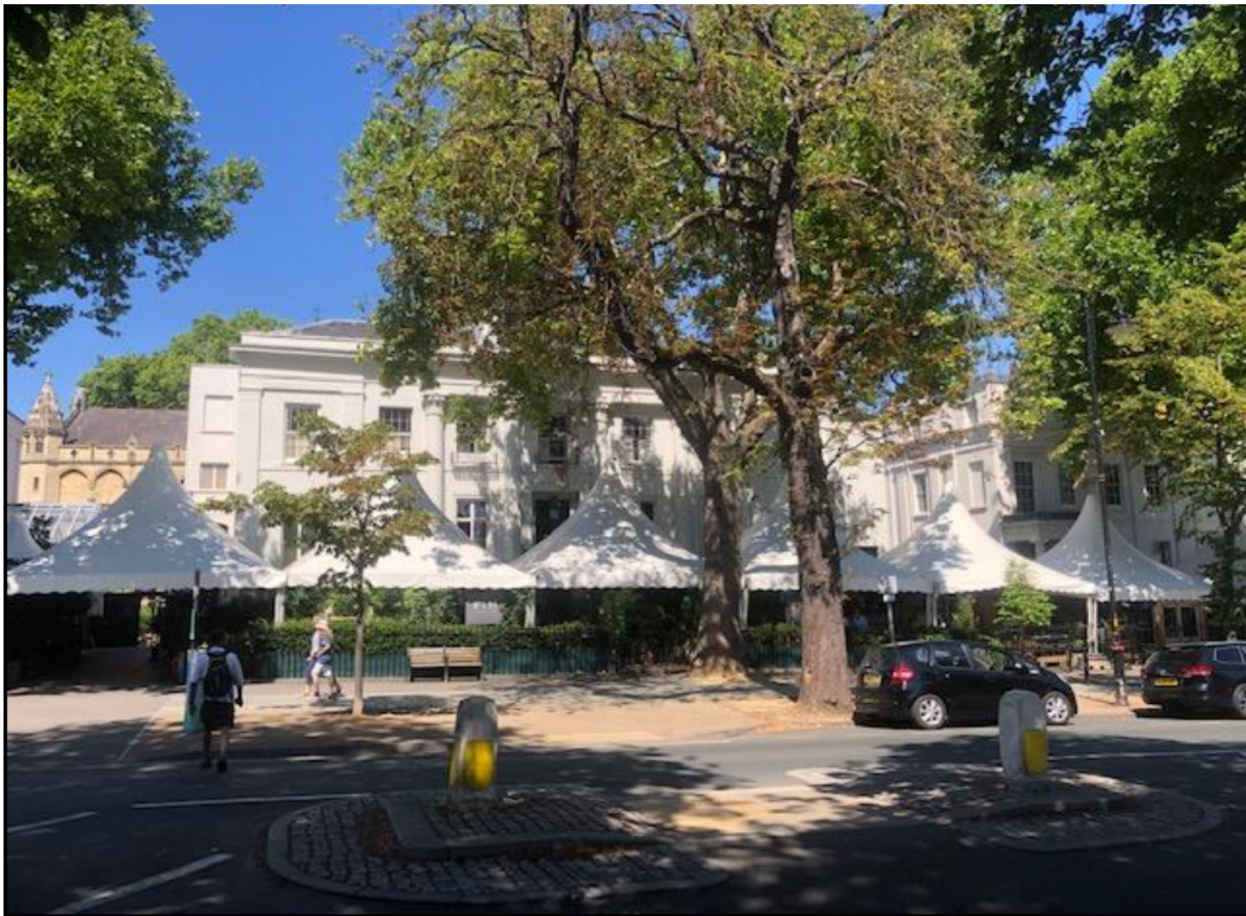
Photograph of the marquees in front of 129 - 131 The Promenade